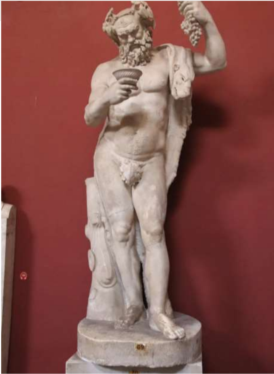
狄俄尼索斯 – 酒神，生殖神 Dionysus – god of wine, god of fertility