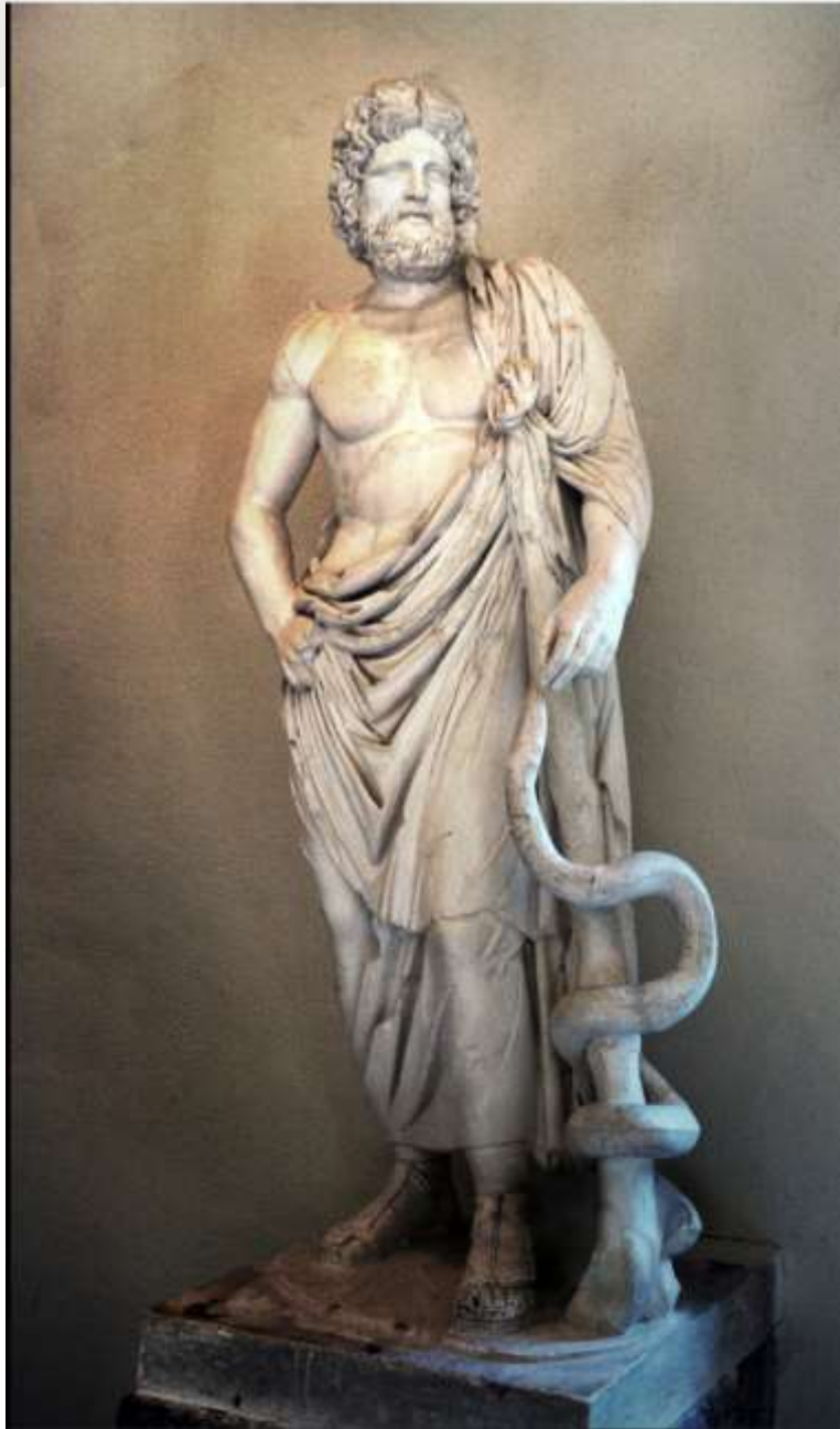
阿斯克勒庇俄斯 – 医神 Asclepius – god of healing